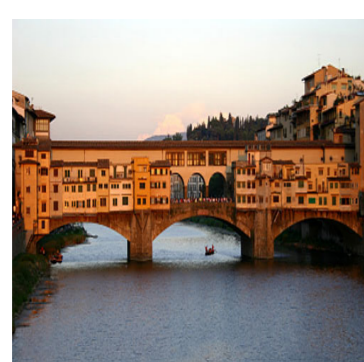
Fig. 4 Ponte Vecchio bridge in Florence

The whole idea for my project started from a small design I visited at my University in Jordan. A tunnel makes a connection between two buildings and the university used to open stores beneath it so it generated extra income for the University. Rents for the spaces were very low and this helped startups get going.