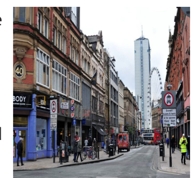
Fig. 5 Manchester-Northern quarter. https://www.manchestereveningnews.co.uk/

The project intends to highlight a major problem that faces workers in England. There are growing problems with office costs and there are opportunities for creatives to inhabit underused spaces at very low cost. In looking at the opportunities for new working patterns I am also keen to realise the advantages of co-working and the wellness and productivity potential of new dynamic solutions.