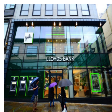
Fig. 4 Lloyds Bank Elevation https://www.lloydsbank.com/

On an afternoon visit to Lloyds bank in Manchester I was surprised to find that the old banking hall was being used by new business in a shared and collaborative venture. Coworking areas were provided so that startup companies and freelance workers could cheaply and efficiently work alongside the bank in a shared space. This realization made me question why we do not use other dead or underused spaces in the city to maximize its use and efficiency.