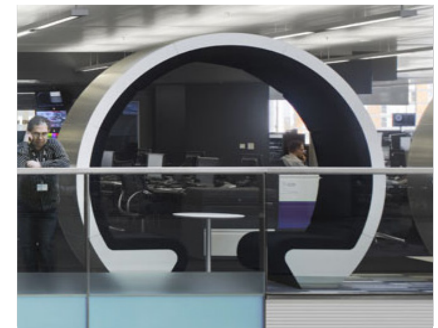
Fig. 3 Ideas for the coworking space design. http://www.idesignarch.com

How bridging spaces in the city can create new connections, a new urban flow and opportunities for working collaboratively.