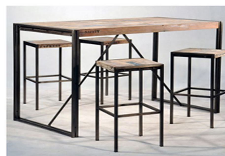
Wooden and steel stools and table