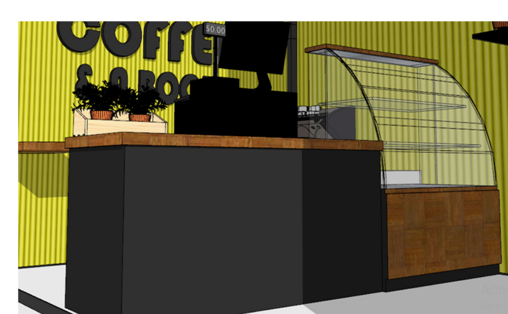
Counter bar and display fridge