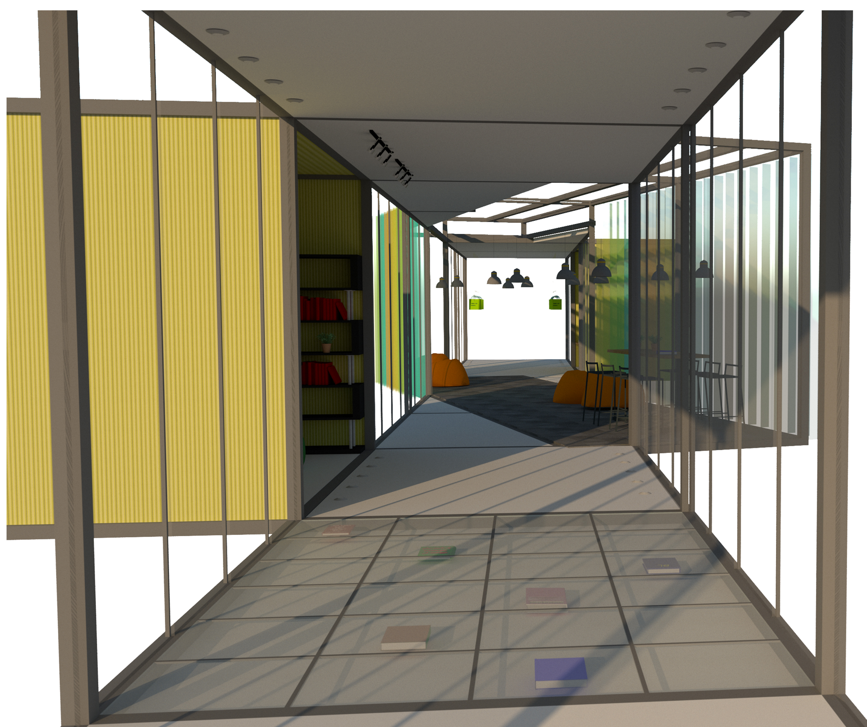
3D interior shot for The Literary Bridge